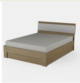
BNLE-D-B Width 180