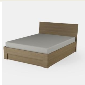
BNLE-D Width 160