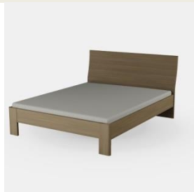
BNLE1 Width 160