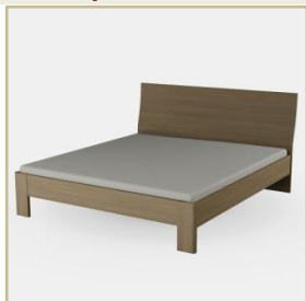
BNLE1 Width 180