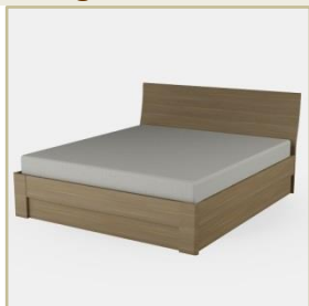
BNLE-D Width 180