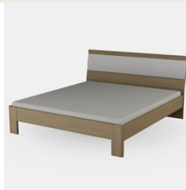
BNLE1-B Width 180