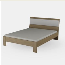
BNLE1-B Width 160